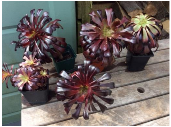
Aeoniums grown from stem cuttings

I'm thrilled that the aeoniums that I took as 2 inch stem cuttings from a very leggy plant bought at the plant fair, have not only survived the winter but are looking fab! Looking forward to planting them out when it's a bit warmer.