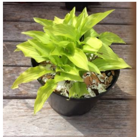
Miniature hosta with eggshells in place, you can see the chomped leaf!

Club meetings are normally held on the 3 rd Wednesday of the month at Milford Community Centre , unless otherwise stated. Doors open at 7pm for a 7.30 start. Refreshments available from 7pm.