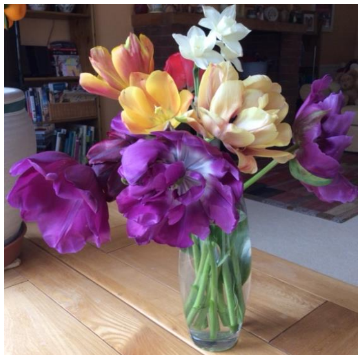
All from my garden

If you would like to share what is going on in your garden that would be a great way for members to stay connected. Send photos with a caption to milfordgardeners@gmail.com and Clare will put them on the website gallery so that we can all see them. I currently have some fabulous peony flowered tulips out and about 5 pots waiting in the wings.