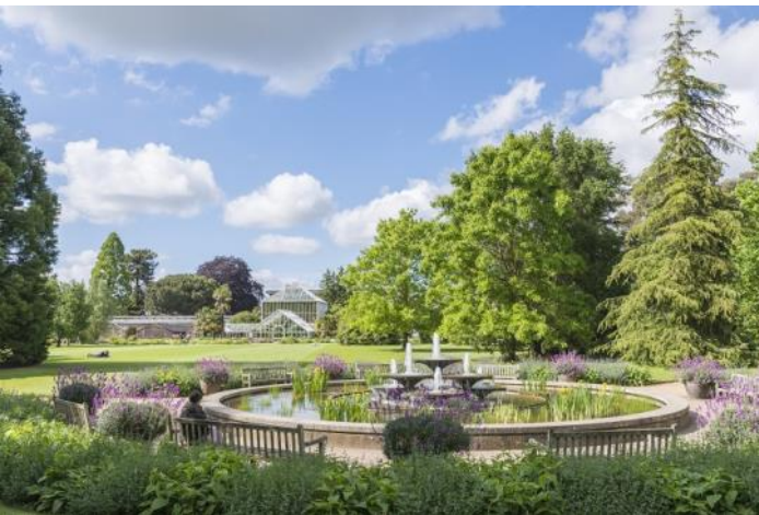
Cambridge Botanic Garden