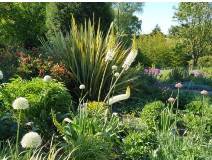
Beth Chatto's garden