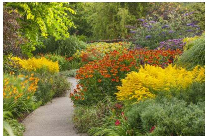
Hot garden at Rosemoor