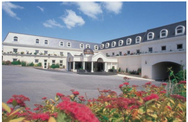
Durrant House Hotel