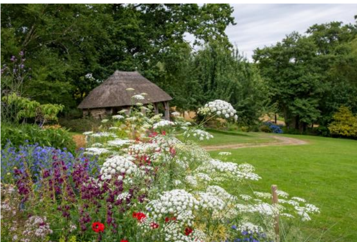
Burrow Farm Garden

NB. The photos from this year's holiday are now on the gallery.