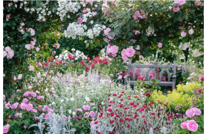
Rose gardens at Rosemoor ↕