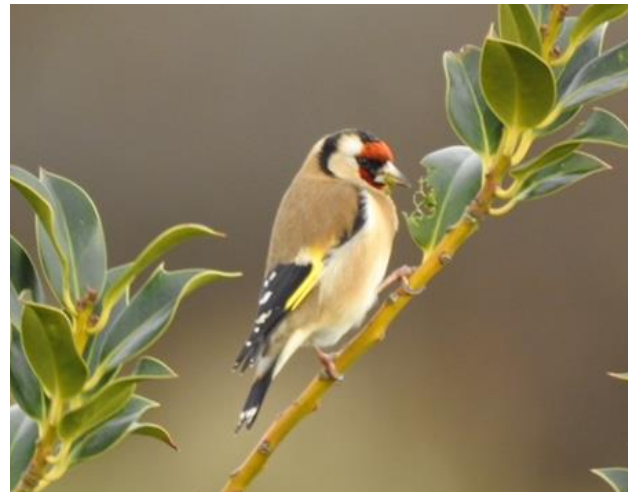
Goldfinch on holly tree