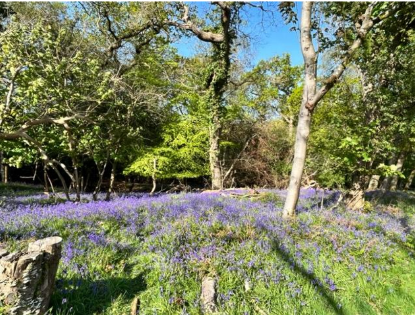
Bluebells in Roydon Woods last week